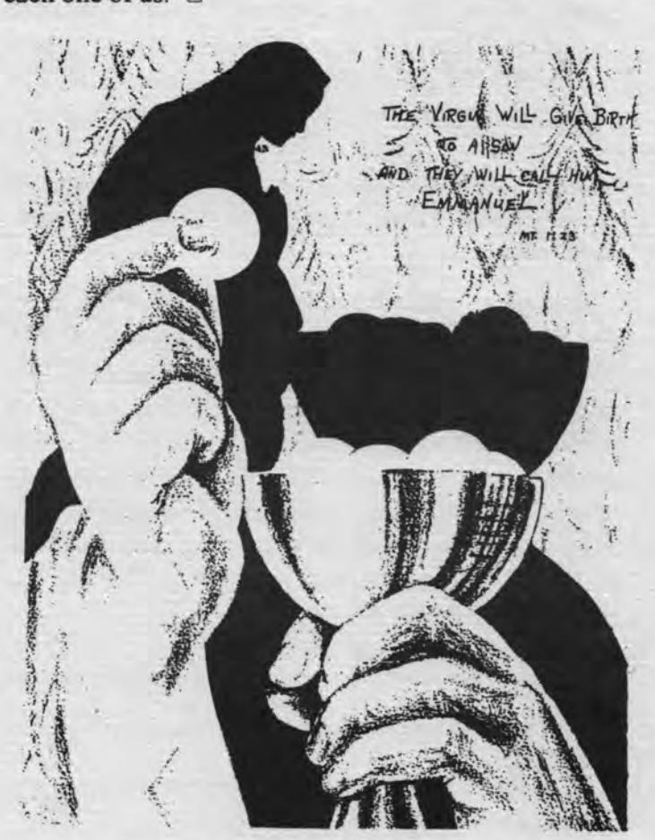
Merry Christmas and a Happy New Year

Today we, the Carmelite community, invite you to share our joy: do something special for yourselves today. it is a day to be remembered, a day when DE-SIRE is crowned, a day to celebrate the power which God has given to the human soul our soul -- the soul of each one of us.