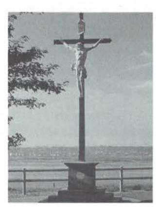
"Cote de Grace" in Honfleur

But more than sorrow she again felt a holy inebriation in view of Jesus who "would be happy" finally to find a heart given without reserve and without restrictions. And the young religious of twenty-two wrote: "0 my Jesus! Let me be this happy victim; consume Your holocaust with the fire of Your Divine Love!"