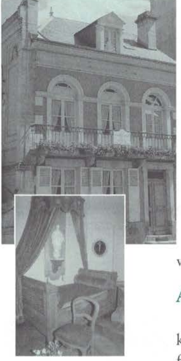
Thérèse's birthplace and room where Zélie died