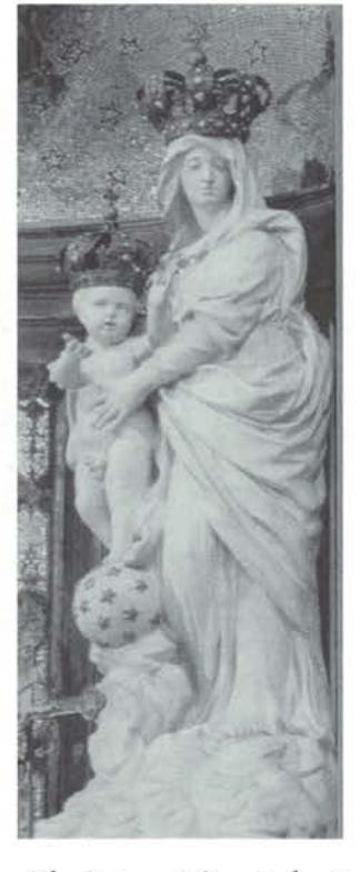
The Statue of Our Lady of Victories

www.ocds2009congress.org * * * REGISTER NOW * * *