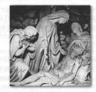
Jesus is Taken Down from the Cross