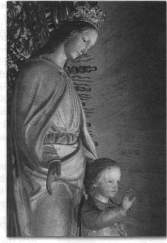
Life-size Image of Mary as a Young Woman Presenting the Child Jesus to the World

Among other interests for the pilgrims are the half-mile outdoor Way of the Cross with fourteen life-sized sculptures representing the