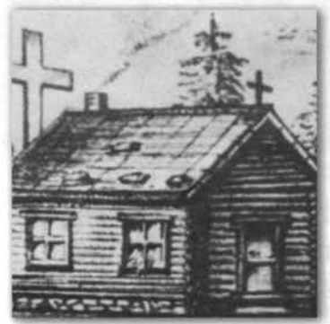
Model of First Log-Chapel shrine

As the rising sun paints the landscape with peaceful colors, small figures emerge from the woods at the foot of the hill and approach the church. They are local people coming to the