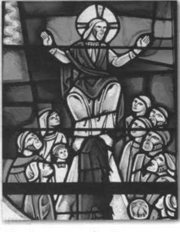
The Sermon on the Mount Teaches Us Spirituality and Trains Us to Love Others

Another great help in this process is the organization of continuous training courses