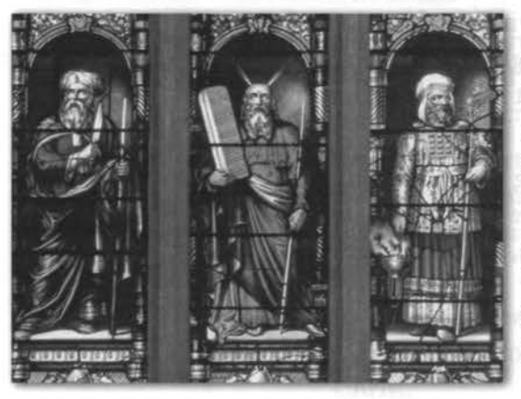
Through baptism we are called to participate "in the priesthood, prophetic and royal, of Christ"

Moving from the personal level to the community level of the Secular Carmel, we encounter an absence of qualified personnel in the pastoral field. This latter was entrusted almost exclusively to priests and religious, as much in the Church as in the Carmelite Order. The Secular Carmelite assisted with organizational structure or materials. The situation was far removed from that expounded in Christifideles Laici when it affirms that the evangelical images of salt, light and leaven, which apply to all followers of Christ, are more specifically connected to the lay faithful because it speaks of their complete absorption in the world and in humanity for the purpose of spreading the gospel.<sup>2</sup> Although it was affirmed that not only the Pastors instituted by Christ could and should take on by themselves the complete saving mission of the Church in the world, in reality, the service and charism of the lay faithful were not recognized, nor, as a result, was their active collaboration in the field of evangelization.