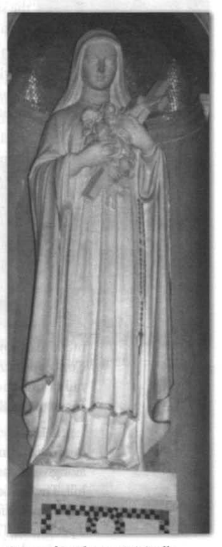
Statue of St. Thérèse Originally Placed in the Old Shrine Church and Moved to the Temporary Chapel During Construction of the New Shrine Church

1926 : The architect of the new shrine was Herman Gaul of Chicago. In order to build the church's foundation the hill was leveled by removing twenty feet from its height. It still stands 1335 feet above sea level and 250 feet above the surrounding countryside. The building materials were brought from Milwaukee via North Lake and Richfield to Holy Hill and then were hoisted by means of cables to the summit.