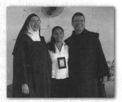
"A new style of collaboration... is gradually evolving"