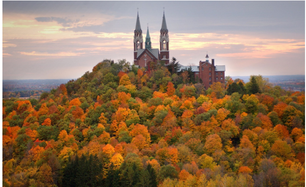
Monastery of Mary Help of Christians, Holy Hill, Hubertus, Wisconsin

It seems to be a common misperception that our Province is named for the city of Washington, DC (where the OCDS Main Office resided for many years). In actuality, the term "Washington Province" refers to the county in which Hubertus, Wisconsin is located: Washington County.