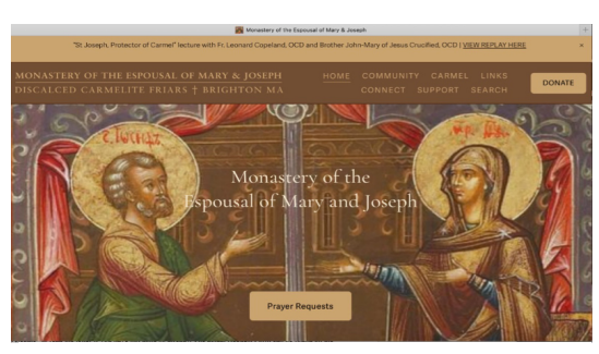
Screen shot from homepage of www.brightonfriarsocd.org

Did you know that the friars' community in Brighton, MA (where the OCDS Main Office is now located) now has a beautiful website? Visit <a href="www.brightonfriarsocd.org">www.brightonfriarsocd.org</a> for information on the community.